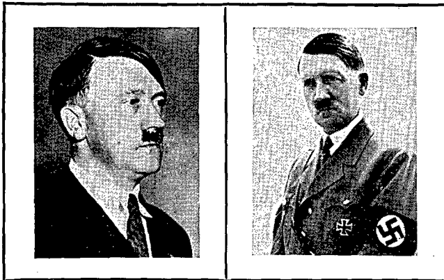
ADOLF SCHICKLGRUBER Alias Hitler

Wanted for MURDER; ARSON; GRAND LARCENY; POSSESSION OF FIRE-ARMS; PIRACY; TREACHERY; RELIGIOUS PERSECUTION.