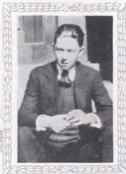
Star (4, 3, 2) Fifth Battalion (3)

Unsat. For further information see the list of those denied special privileges until by positive action on their part they show that they merit further consideration.