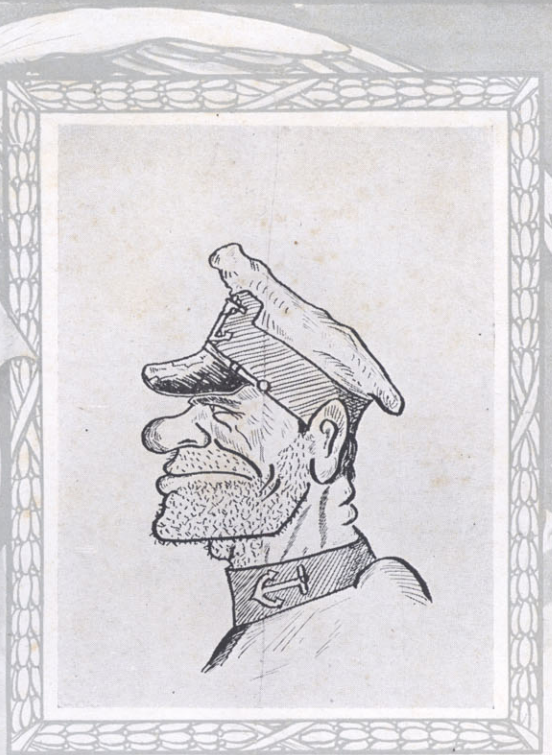
P. A. LIST