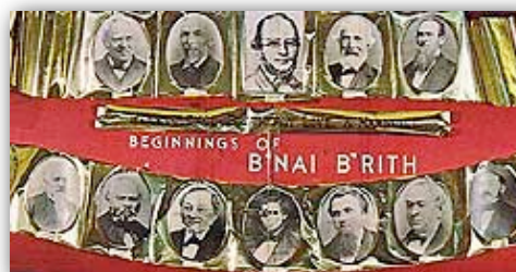
Rare images of the men who founded B'nai B'rith at Sinsheimer's Café in New York City on October 13, 1843.

(CINCINNATI, OHIO and WASHINGTON, D.C., May 24, 2012)—B'nai B'rith International—widely considered by scholars and historians to be the most important Jewish membership organization in American Jewish history—has announced that the contents of its archives and its Holocaust and Related Materials Archives will be relocated to the Jacob Rader Marcus Center of the American Jewish Archives in Cincinnati, Ohio (AJA). The AJA is located on the Cincinnati campus of Hebrew Union College-Jewish Institute of Religion.