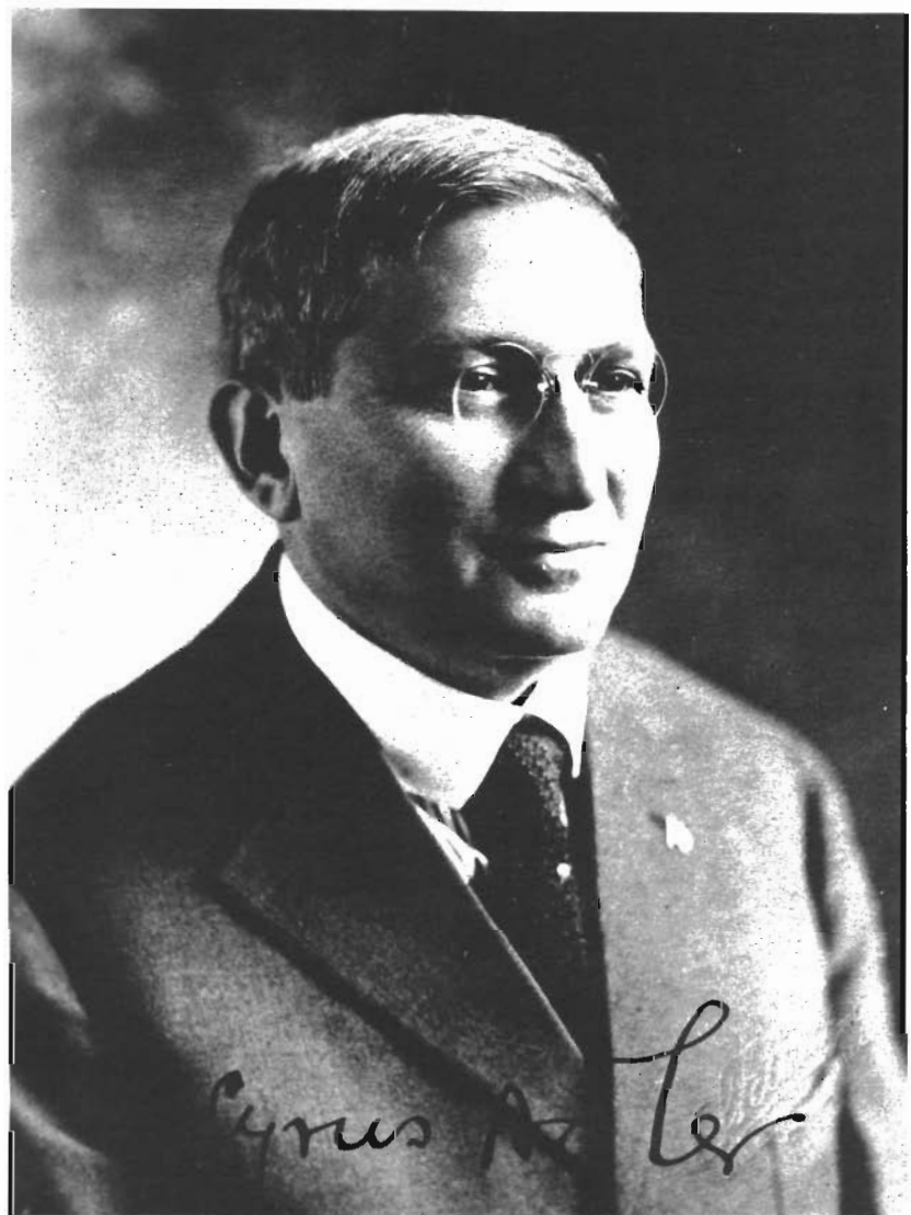
Cyrus Adler (1863–1940) American Jewish communal leader, academic, and a founder and president of the American Jewish Committee